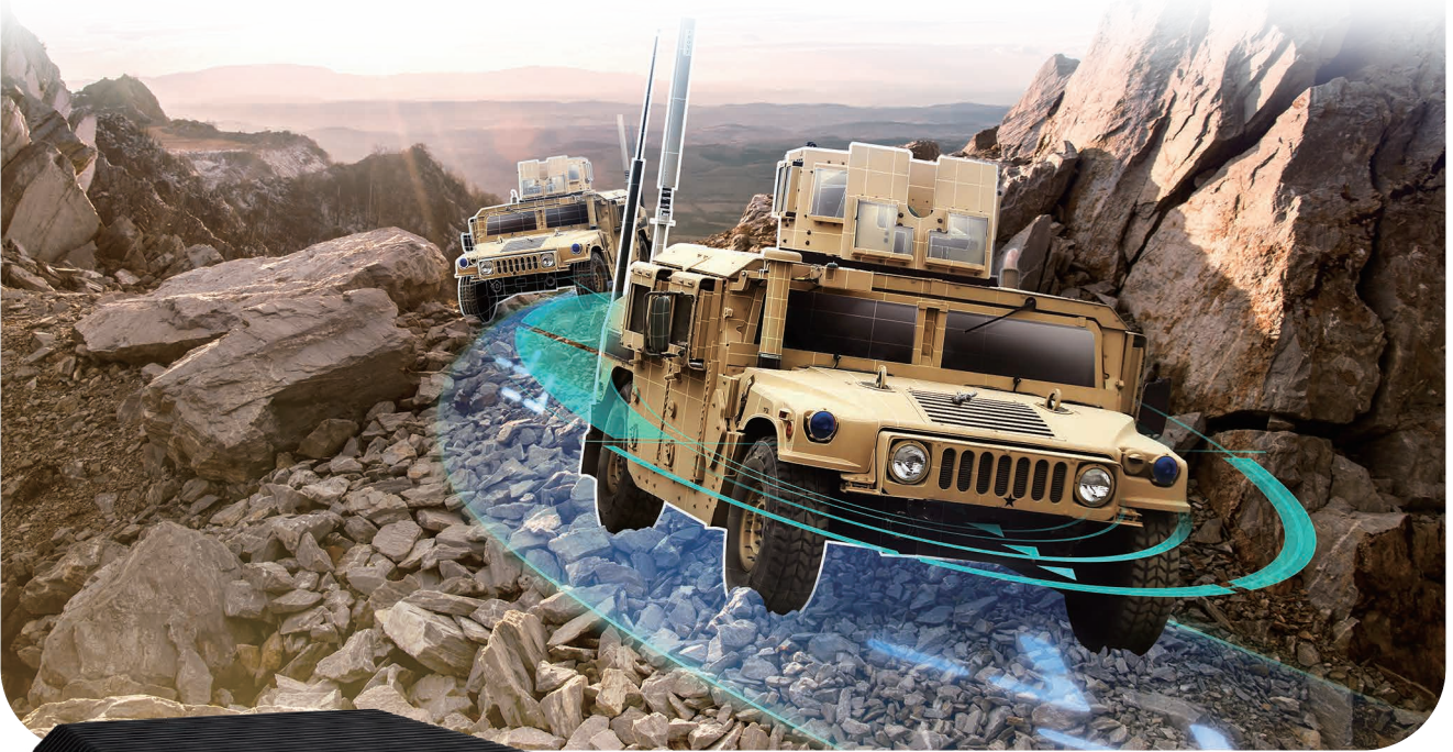
^ Advanced Driver Assistance Systems (ADAS)

Intel® Core™ i9/i7/i5/i3 Processor (14th Gen) Workstation-grade Fanless High Endurance System