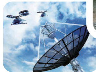
▼ Robotic Control