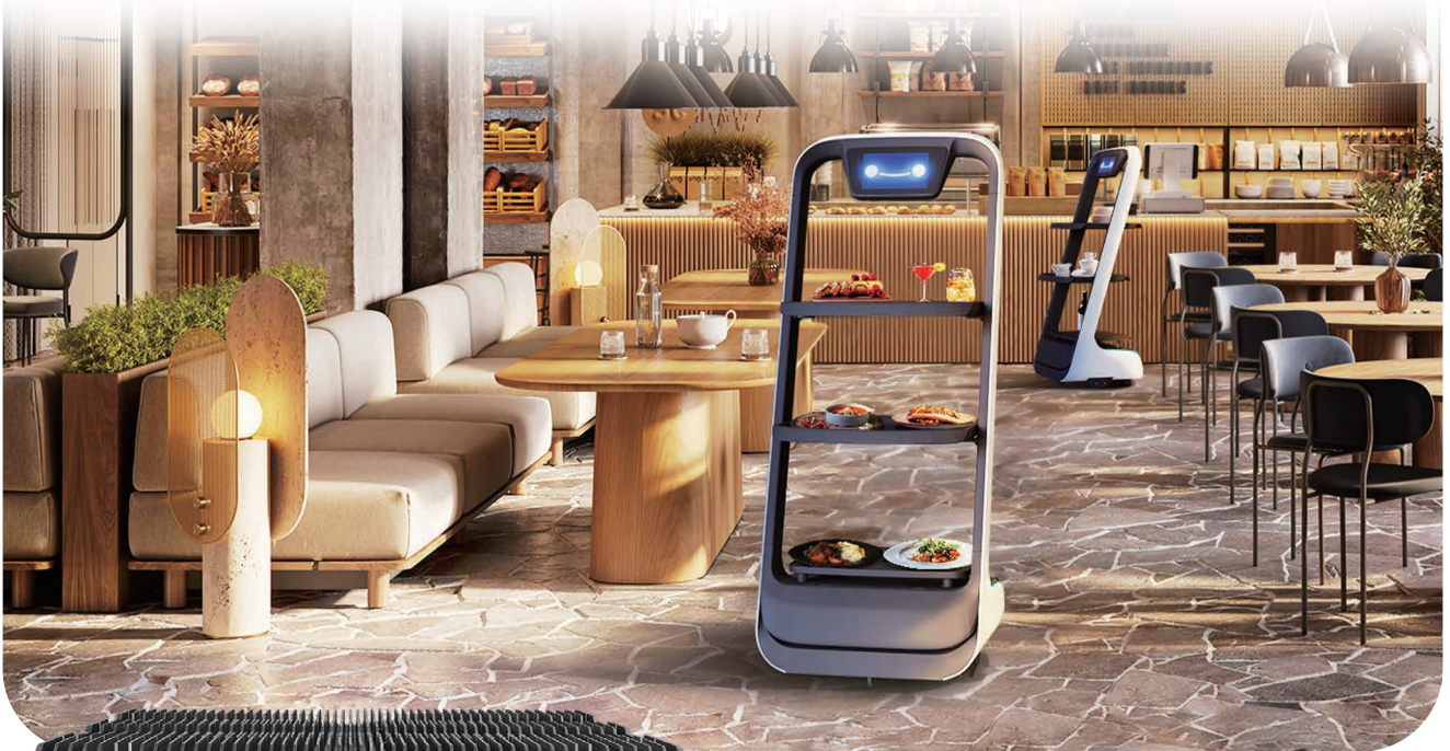
^ Robot Waiter

Workstation-grade Expandable Fanless Embedded System