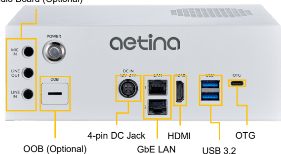
Audio Board (Optional)