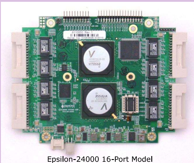
Epsilon-24000 16-Port Model