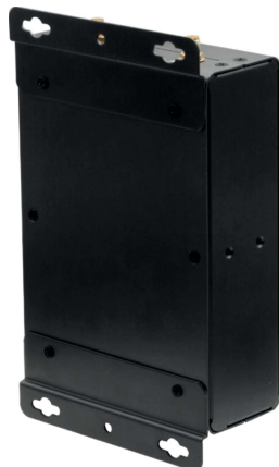
Wall Mount Illustration