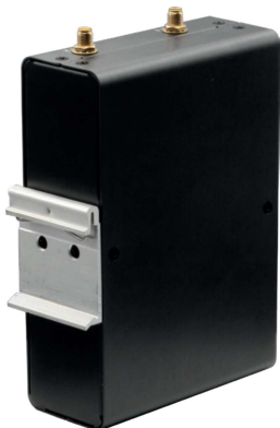
DIN-Rail Mount Illustration